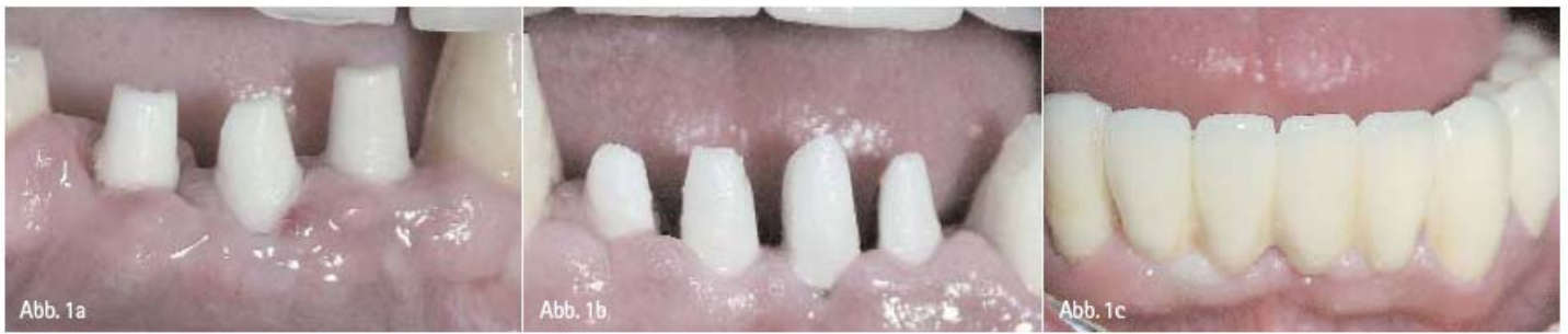
Fig. 1a-c: View of two cases with immediate implantations (extraction and implantation in just one session) with Champions® implants View of three and four cementable zirconium Prep-Caps, respectively, 14 days after surgery (Fig. 1a–1c: Intraoral camera pictures).

The Champions® implant is not actually considered as a classical “ingrown” implant but rather as an “osteotome implant“ on which a prosthodontic restoration can easily be fitted. Due to the crestal micro-thread of this implant, the lateral surrounding bone can be condensed so that excellent primary stability can be achieved (Fig. 1a-c). This has been proven by long-term studies for several years about bones and aesthetics, such as about aesthetic problems with single front teeth in the upper jaw and immediate implantation. One -piece implants are more beneficial than two-piece implants since due to their design, there is not the problem that the internal screw can loosen or break as is the case with two-piece implants. In addition, there is a lower risk of developing peri-implantitis because of bacteria penetration in the micro-gap, a problem with two-piece implants. In addition, one-piece implants allow a subcrestal implant positioning.