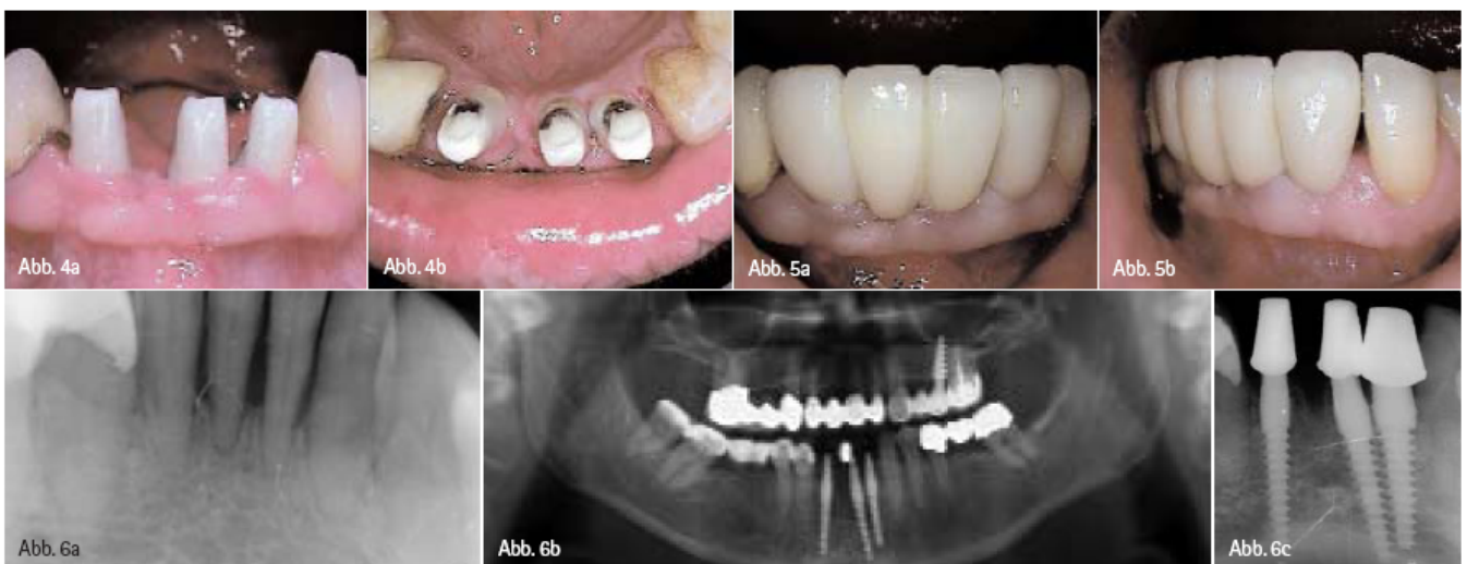
Fig. 4a-b: View of the mucosa, which is not irritated, twelve days post extractionem and implantationem. The remains of the Implantlink cement can be removed completely and without any problems.