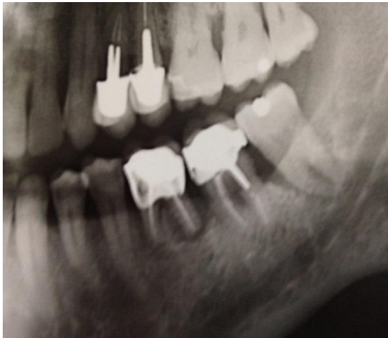
Prior to treatment

Results: After two month implant stability is achieved. Prosthetic device was accomplished following healing of implant procedure. A one year follow up shows that autologous tooth graft is best for long lasting implant stability.