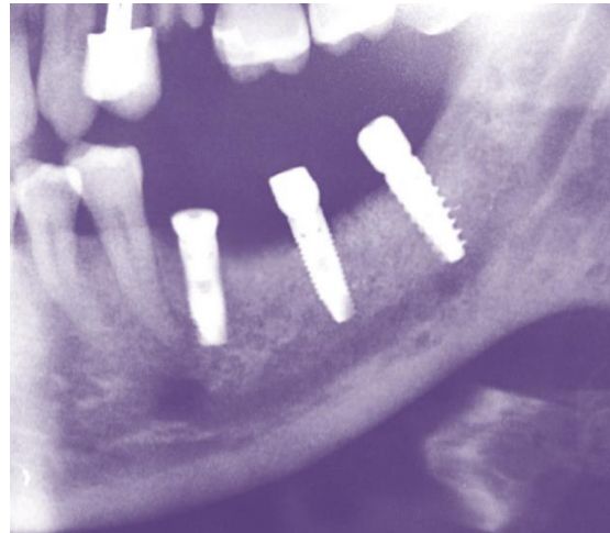
2 month after grafting implant insertion.